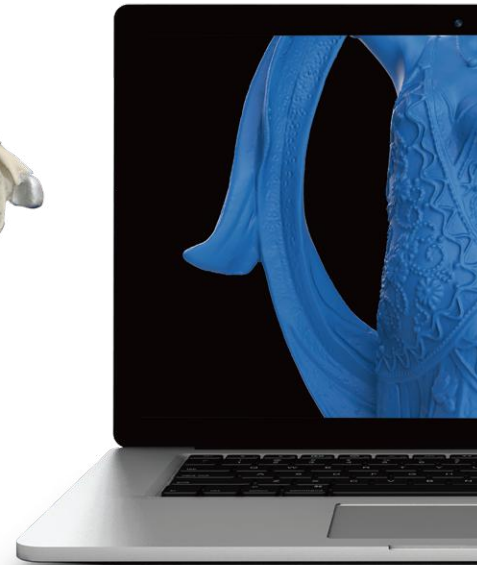
Handheld HD Scan Mode